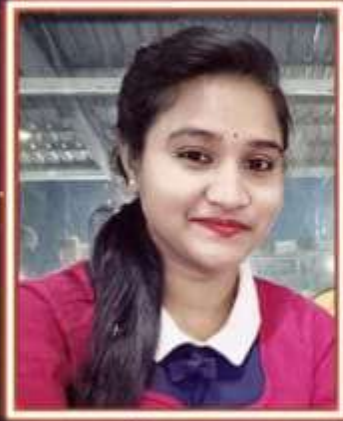
Temin sahu NORCET 2021 AIIMS , RAIPUR AIR - 775